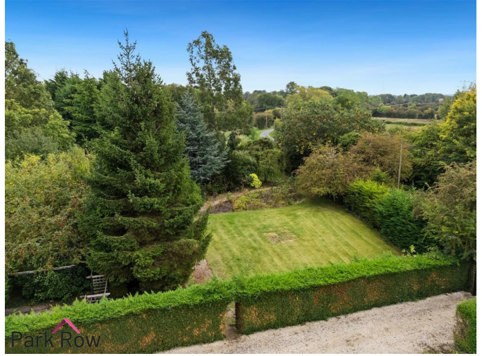
Extensive grounds to the side elevation, three areas are mainly laid to lawn with areas of established trees, shrubbery and bushes, a paved area with space for seating, the rest is mainly laid to lawn,