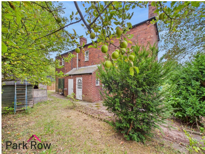
A dwarf wall greenhouse, established fruit trees, bushes and shrubbery, the rest is mainly laid to lawn